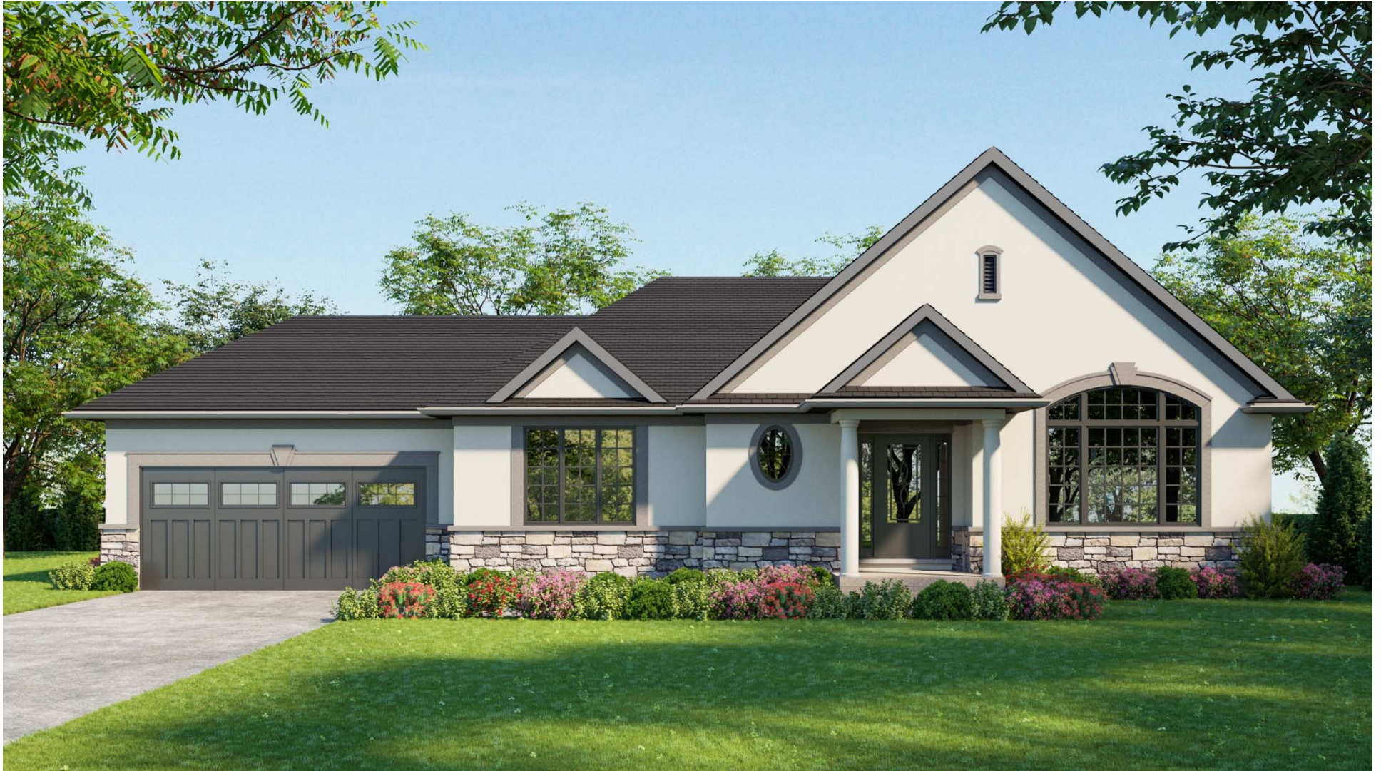
THE THUNDER BAY