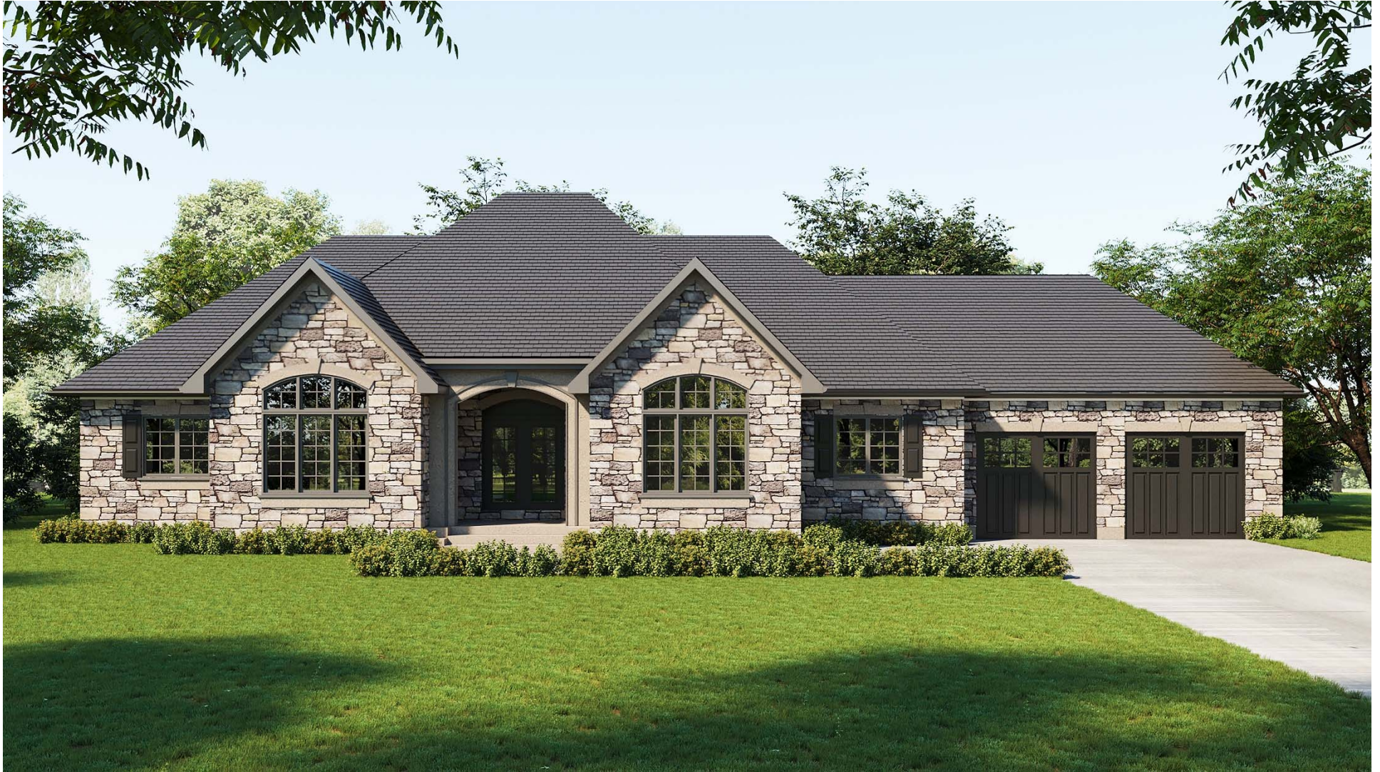
THE ST. CLAIR