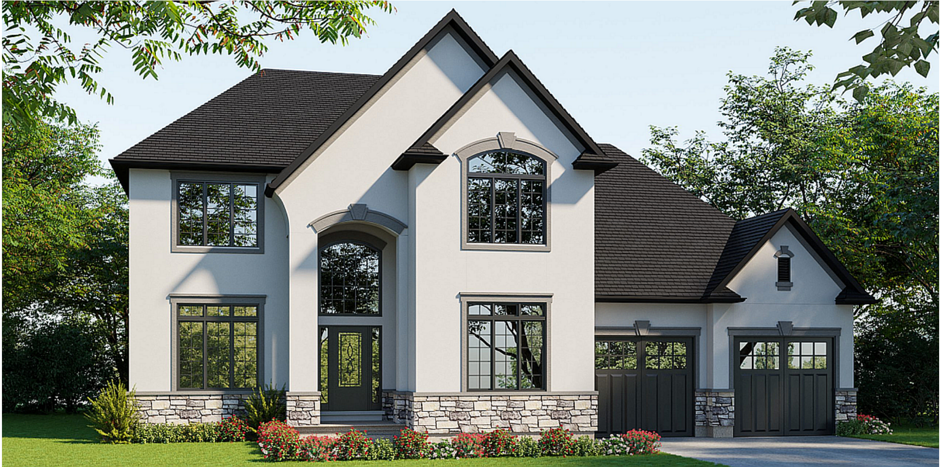
THE RICHMOND HILL