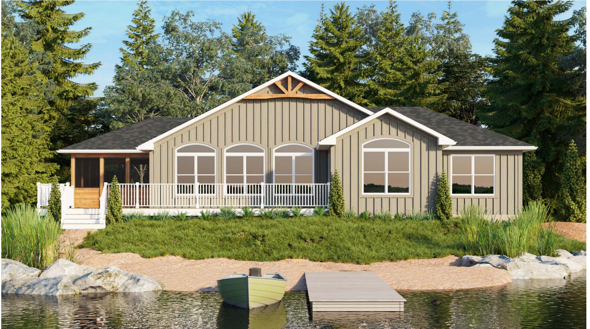
THE PARRY SOUND