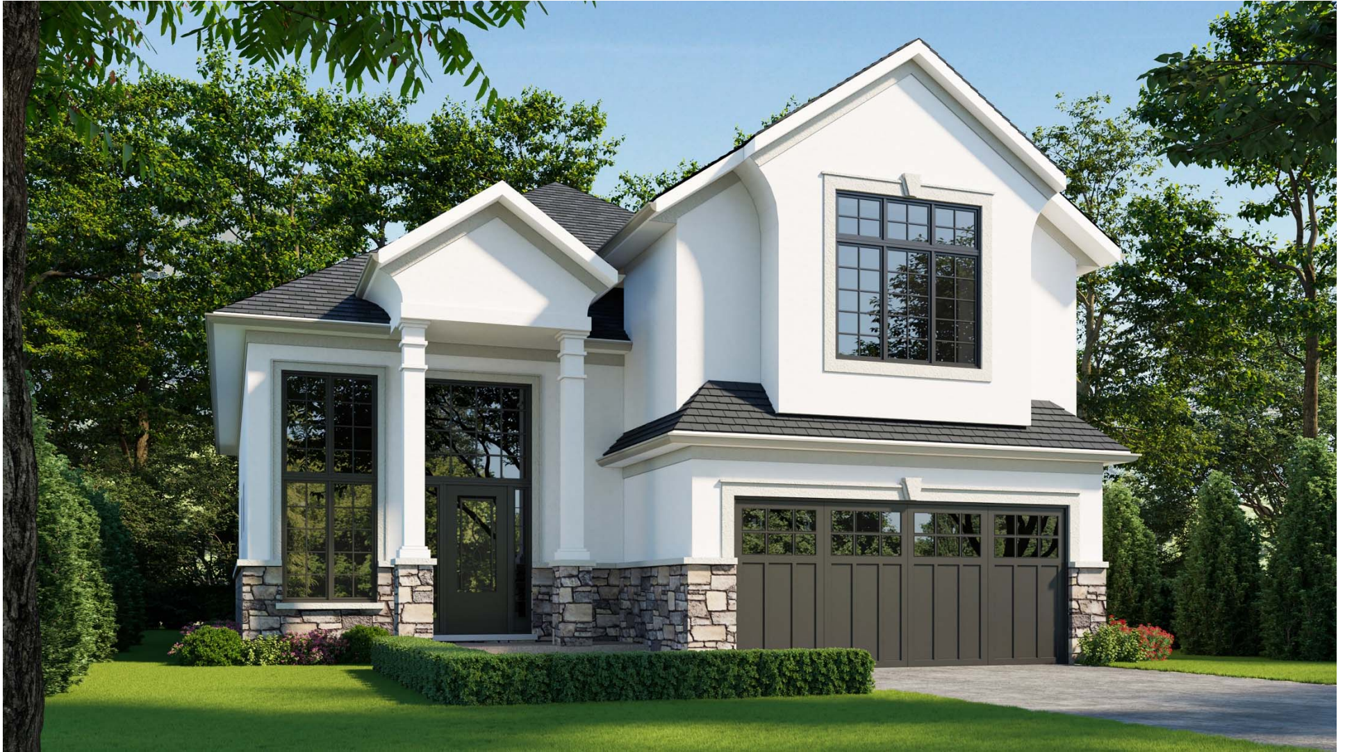
THE NOVA SCOTIA