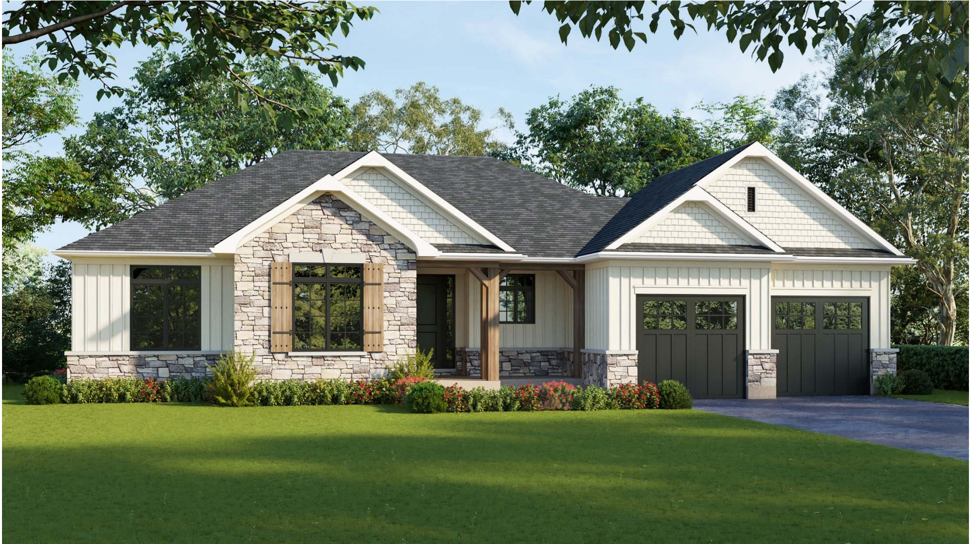
THE NORTH BAY